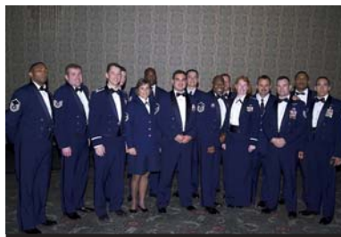
Racquetball's Finest Service Men & Women